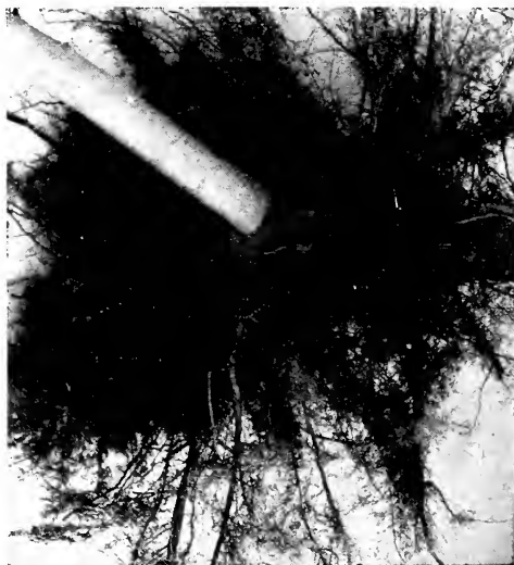
Root System of Oft-Transplanted Tree

THIS tree has been oft transplanted. All Rosedale trees are. The result is a compact mass of fibrous roots close to the trunk. Thus the foundation is safe from the digger's spade and you are insured against loss or tardy growth.